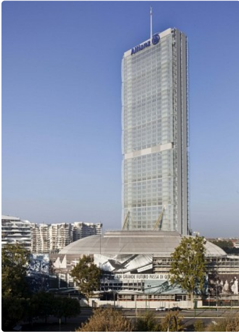
Click an image to view larger version.